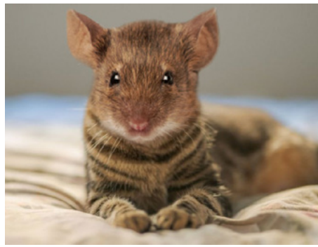
Gummi Tafoya created a "catouse", a hybrid of the classic cat and mouse duo.