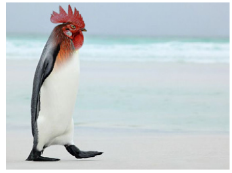
Samantha deSaulles created a "pengooster", an out-of-the-box hybrid of a penguin and rooster.