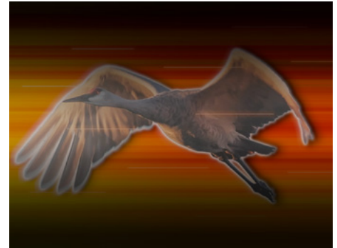
Alex Fuchs used a gradient fill for this beautiful sunset-like background and applied an outer glow to the bird, an object he put into the design.

The students were also challenged to create a realistic animal morph using Photoshop and images of two animals of their choice for their fall final projects. Students needed to retain some elements of each animal's texture of fur, feathers, scales, etc.. Here are a few samples of their creative morphs: