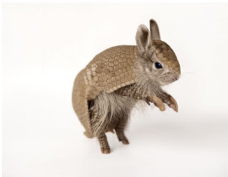
Alan Johnson created a "haradillo", a unique hybrid of a hare and an armadillo.

The students were also challenged to create a realistic animal morph using Photoshop and images of two animals of their choice for their fall final projects. Students needed to retain some elements of each animal's texture of fur, feathers, scales, etc.. Here are a few samples of their creative morphs: