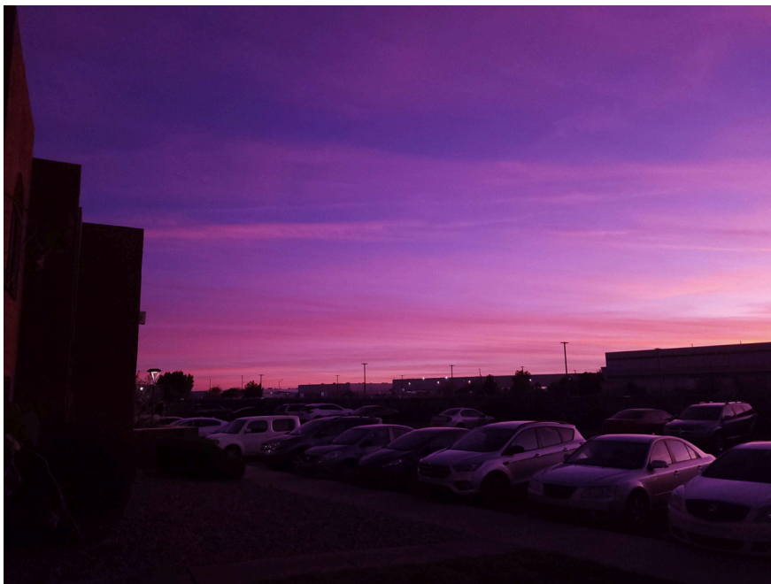
Alex Fuchs - Photography