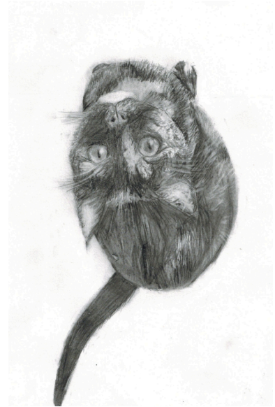
Cetti Behrens - Graphite